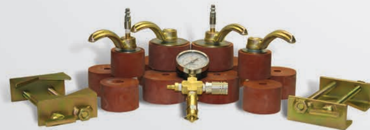
ONE KIT TESTS ALL SIZES OF COOLERS

DOES YOUR CURRENT KIT HAVE SAFETY LOCKS?