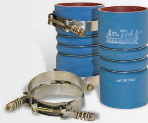
ALL HOSES ARE HOT-SIDE RATED

REUSING OLD HOSES & CLAMPS DOESN'T MAKE SENSE WITH A LONG LIFE COOLER.